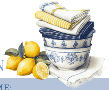
TABLE TOP VIEW SKETCH: